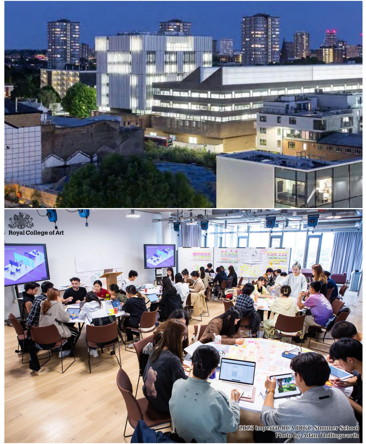
Photos above: RCA New Executive Education spaces, Rausing Research & Innovation Building, Battersea, London, SW11 4NL.

On days, 3, 4 & 6, classes will take place at Royal College of Art's new London campus. Designed by internationally acclaimed architects, Herzog & de Meuron, the £135 million, 15,500 sqm campus is the largest investment in transformational space in the RCA's 185 year history. The classes will take place in the dedicated Executive Education spaces on the top floor of the Rausing Research & Innovation Building, with 360 degree views of London – eight floors of dedicated independent and confidential research space for areas such as materials science, soft robotics, advanced manufacturing, intelligent mobility, and AR and VR visualisation, housed in the Snap Visualisation Lab.